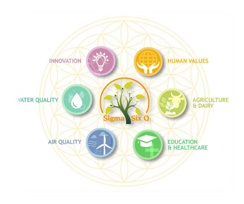
Dedicated to Sigma Six Quality & Values