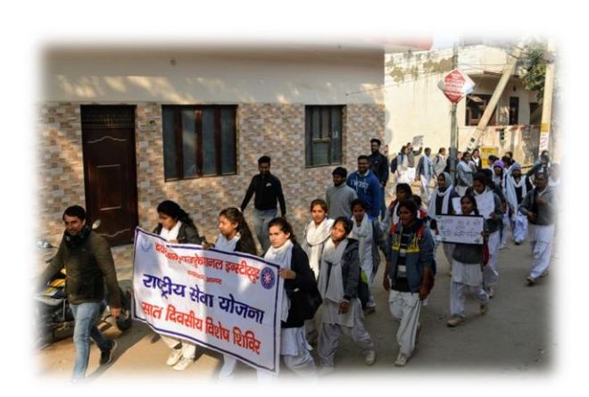
Glimpses Social Service @ Adopted Villages & Slums