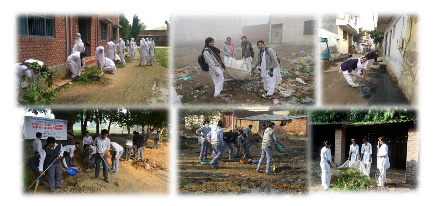
Swachh Rail – Swasth Safar Abhiyaan