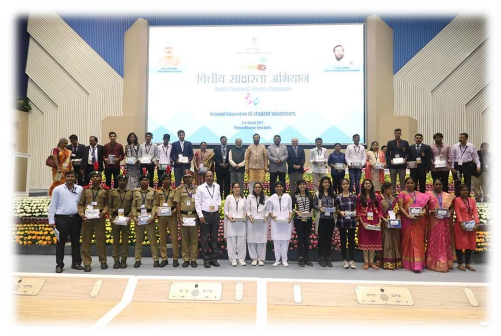
National Award for Best Performance in Financial Literacy Campaign